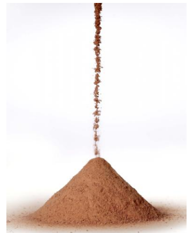
Qrill™ meal

Contact Sigve Nordrum Phone +47 24130188 or +47 91630188 Email sigve.nordrum@akerbiomarine.com