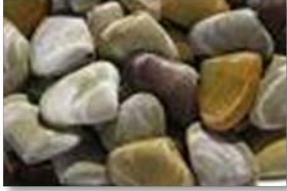
Pipi (Goolwa cockles)

2011 MSC Surveillance Visit Report Certificate Number: SCS-MFCP-F-0075