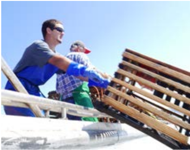
Hauling in a rock lobster pot

The Western Australia Rock Lobster is caught using baited pots and traps . These are fitted with special Sea Lion Excluder Devices (SLEDs) which block access to juvenile sea lions while still allowing lobsters to be caught.