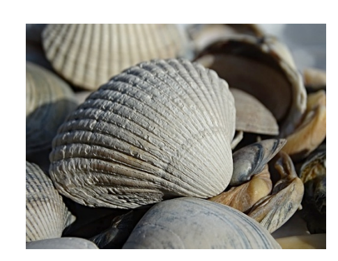
Tuangi / Cockle