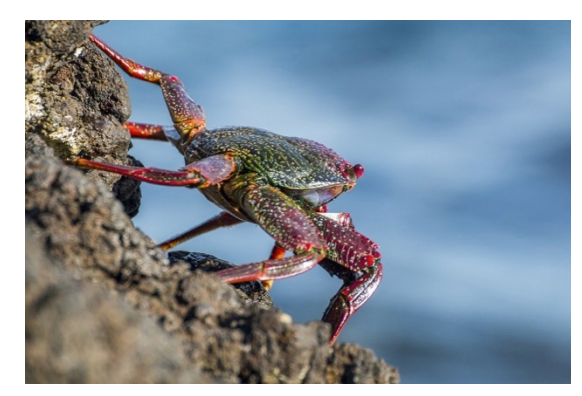
Pāpaka / Crab