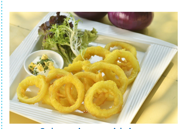
Calamari or squid rings