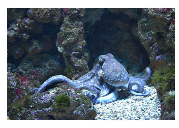
Whēke / Octopus