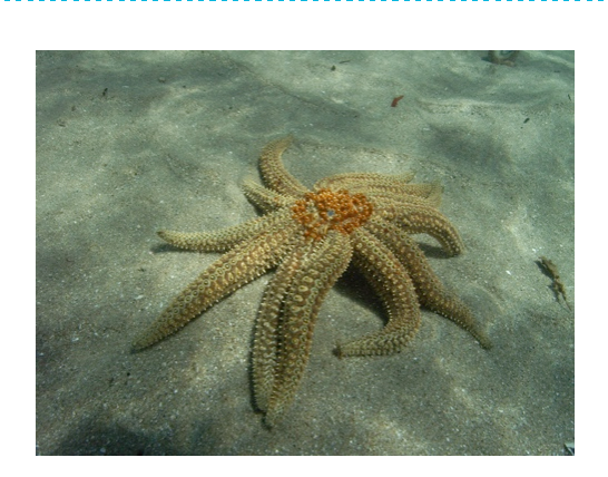
Pātangatanga / Pātanga / Pekapeka / Starfish