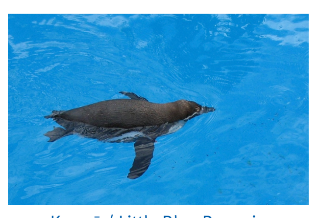
Karorā / Little Blue Penguin