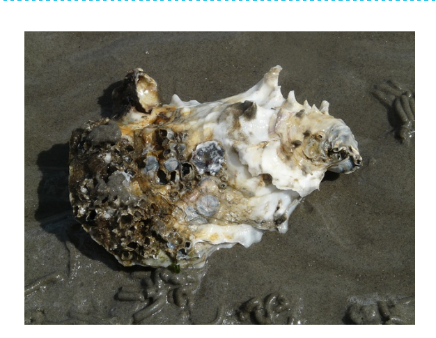
Tio / Oyster