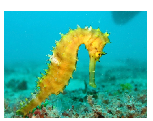
Manaia / Sea horse