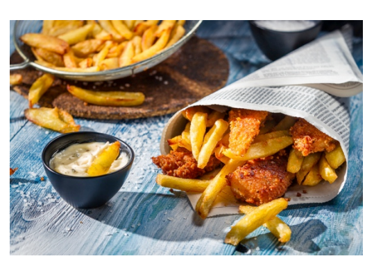
Fish and chips