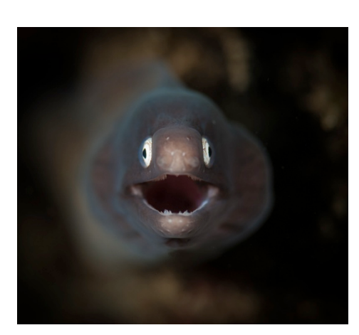
Tuna / Eel