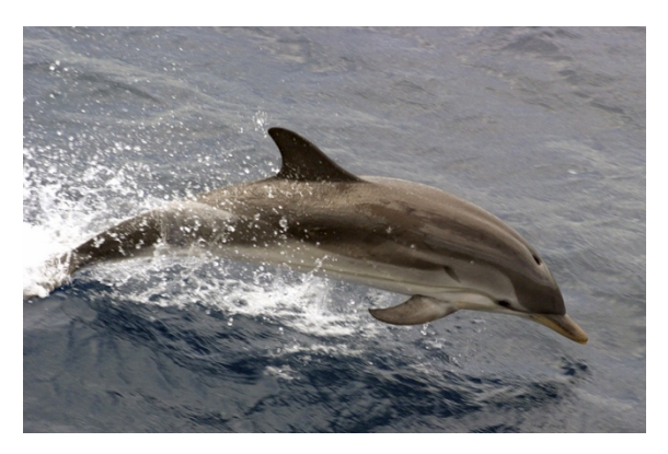
Pāpahu / Dolphin