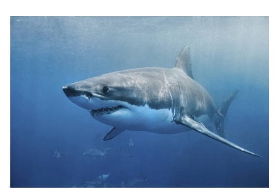
Mangō / Shark