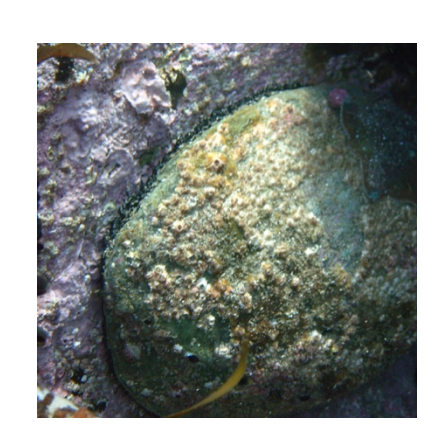
Pāua / Abalone