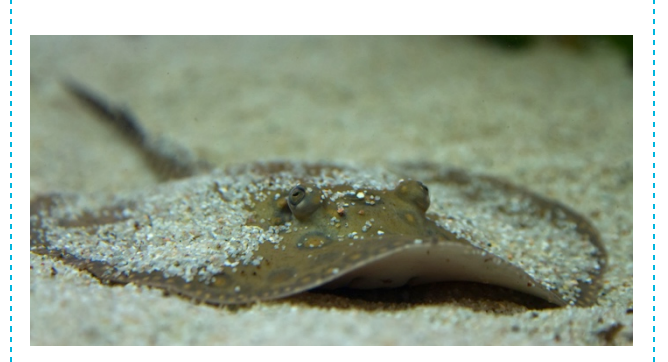
Whai / Sting ray