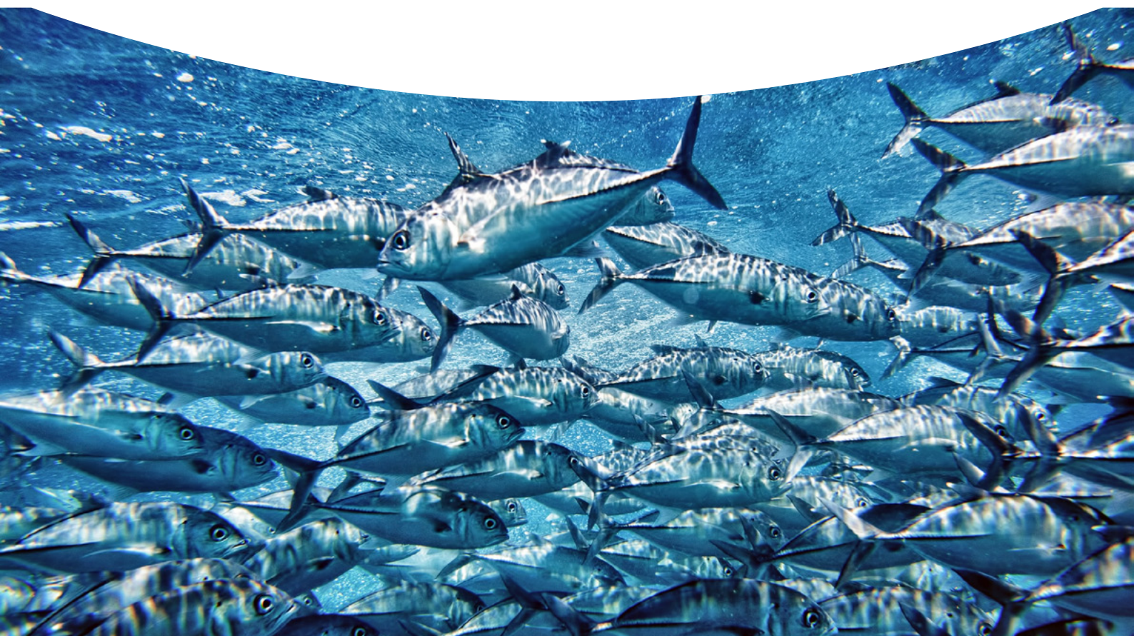
Table 1: Tuna fisheries engaged in the MSC program in France